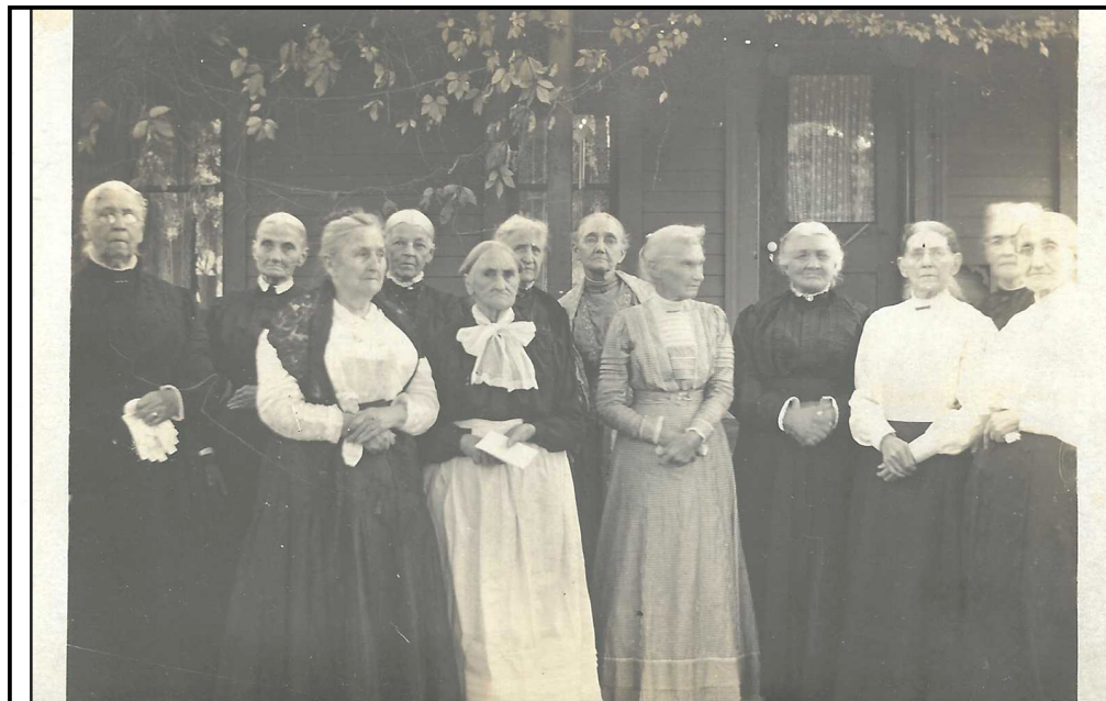
The Merry Circle ~1900