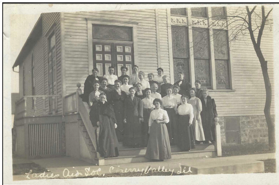
Ladies Aid Society