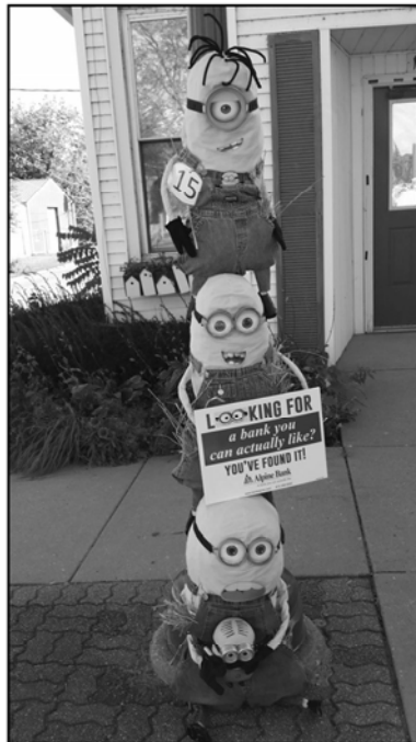
First Place - The Minions created by the staff at Alpine Bank

The annual scarecrow competition sponsored by the Cherry Valley Library adds a lot of fun to the downtown area in October. These years' winners are: