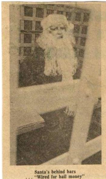
Santa's behind bars ... "Wired for bail money"