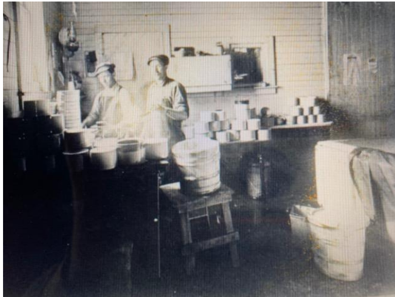
Cherry Valley Creamery. Two men making cheese in the CV Creamery. Photo undated.