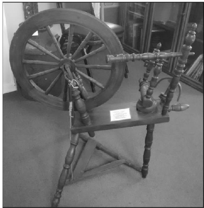
Antique Spinning Wheel